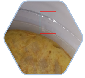
Bubbles in the heat-sealing