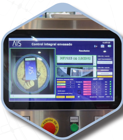
Image processing capacity to inspect products at high speeds .

Designed for the complete inspection of packaging and its contents , it is the perfect ally for quality control in products such as pizzas, tortillas, sliced products, meats, fish, etc.